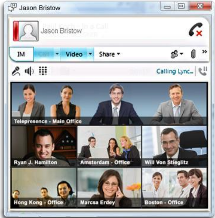
Microsoft Lync in a continuous presence multipoint call including a telepresence system

Unlike an MCU which is designed to handle multipoint conferencing connections, a gateway is based on logic specific to one-to-one connections. Gateways are measured by the number of simultaneous calls or sessions the device can support.